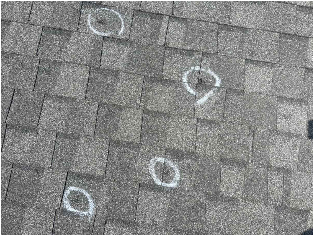
Left Slope Hail Damage