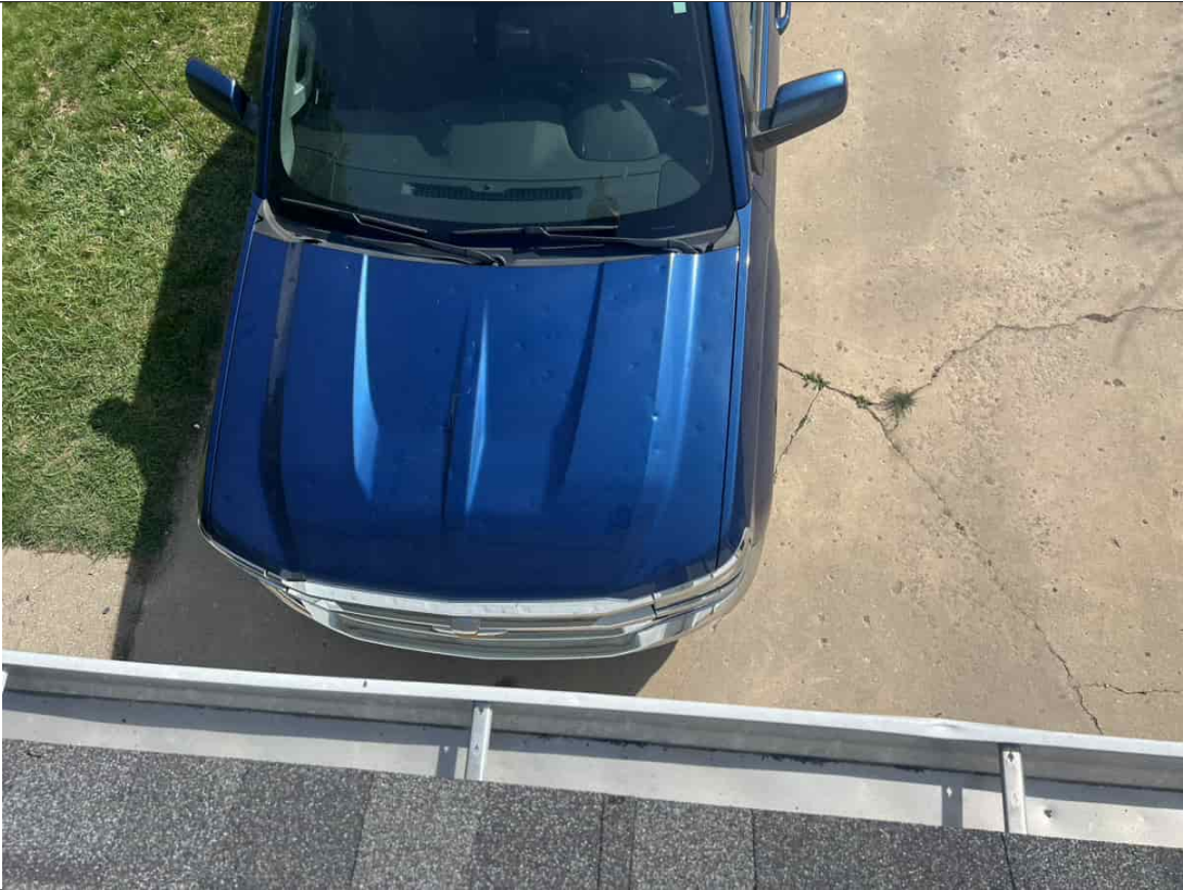
Component Hail Damage