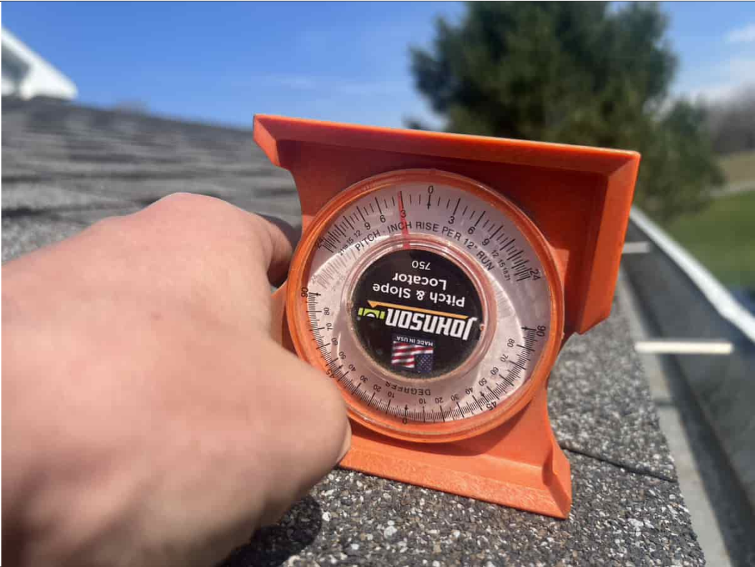
Roof Layers Overview