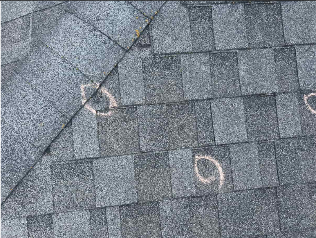
Back Slope Hail Test Square