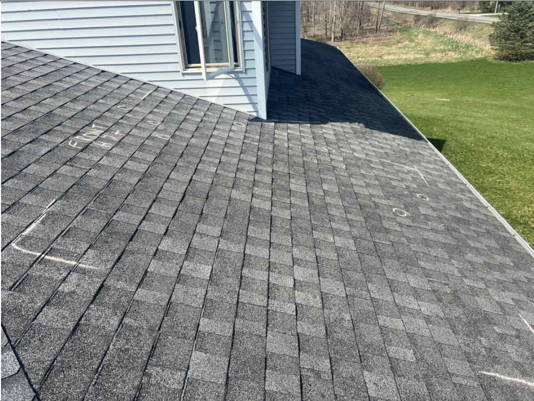
Front Slope Hail Damage