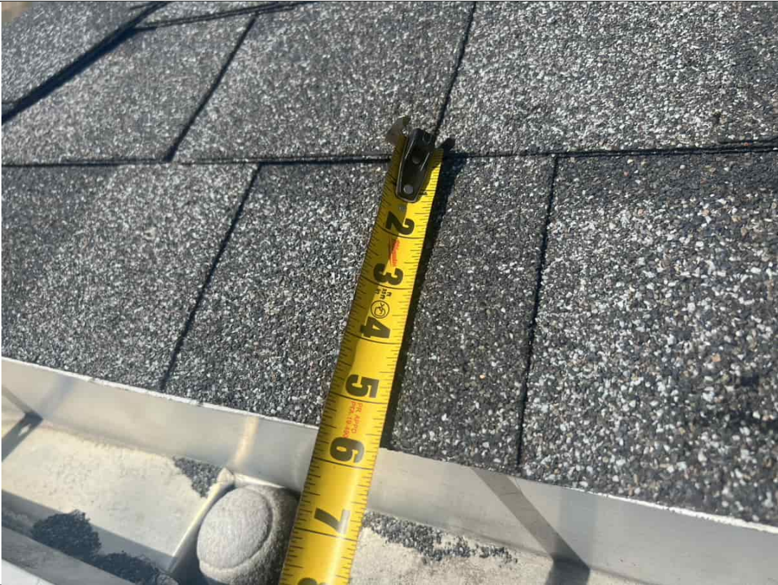
Shingle Gauge Measurement