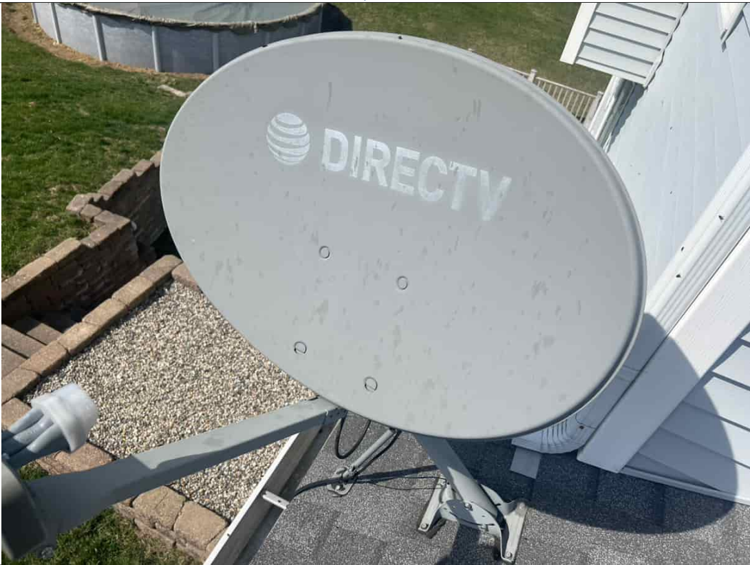
Front Slope Overview