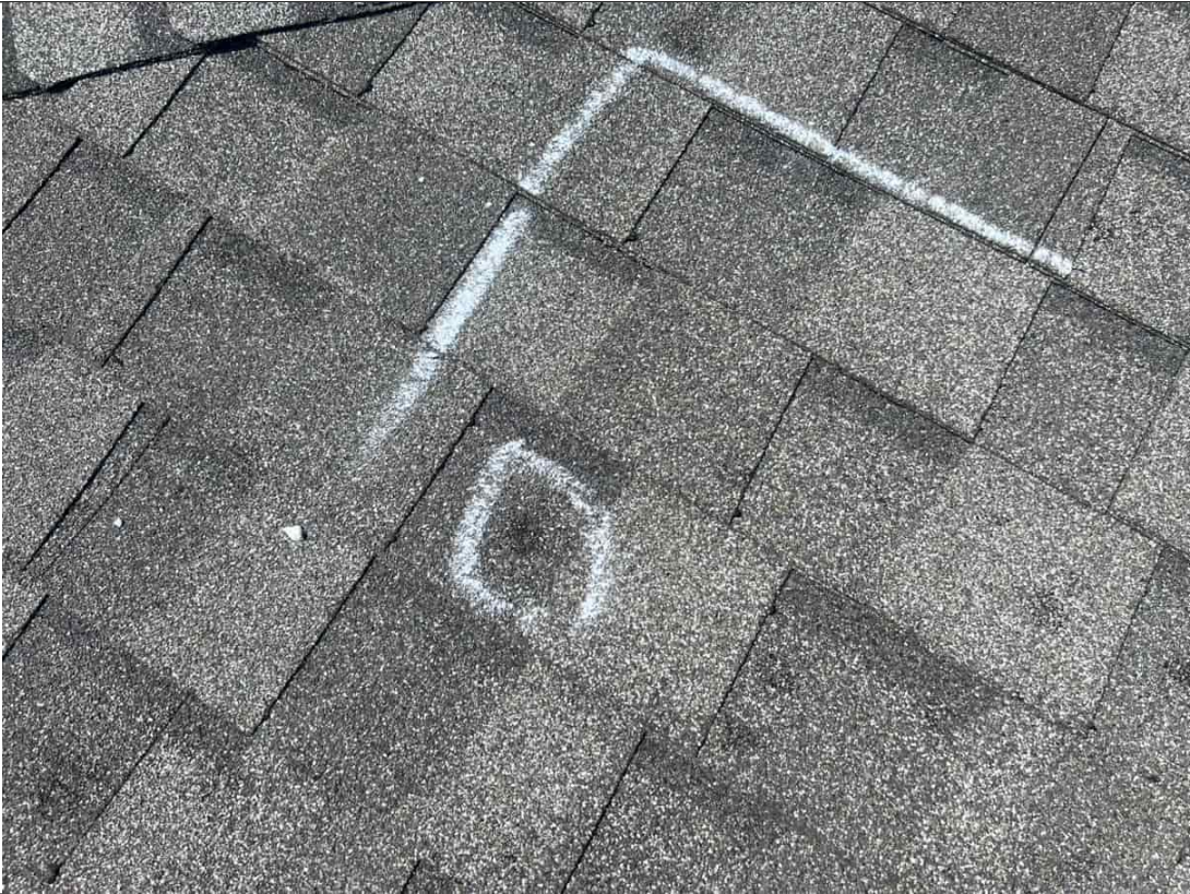
Back Slope Hail Damage